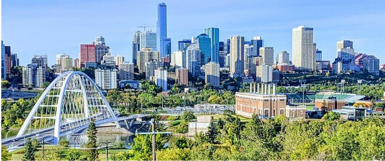
Edmonton skyline