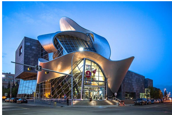
Art Gallery of Alberta