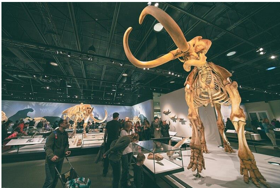
Royal Alberta Museum

We look forward to seeing you in Edmonton.